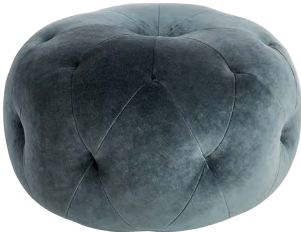
ottoman 13"H x 20"-diameter velvet pouf in blue, $89, crateandbarrel.com