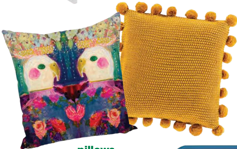
pillows From left: Cockatiel 18" x 18" polyester pillow, $43, femmehesse .etsy.com; Artistic Weavers Liviah 20" x 20" polyester pillow, $54, homedepot.com