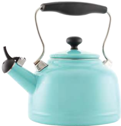
kettle Vintage 1.7-quart enameled-steel kettle in aqua, $50, chantal.com