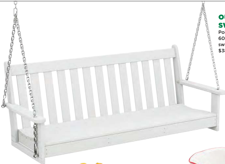
outdoor swing Polywood Vineyard 60½"-wide plastic swing in white, $389, lowes.com