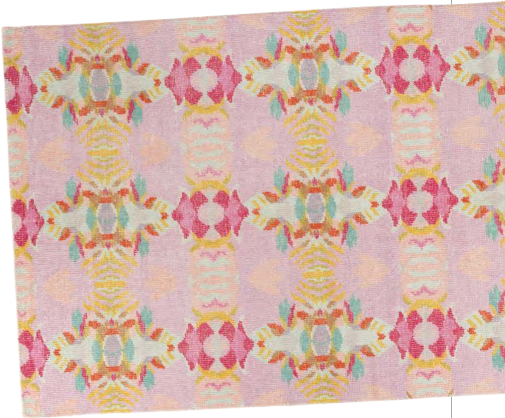
rug Dash & Albert Casar 5' x 8' cotton, wool, and polyester rug, $1,368, annieselke.com