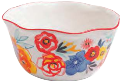
bowl The Pioneer Woman Flea Market 10½"-diameter stoneware bowls, $25 for a mixed set of 3, walmart.com