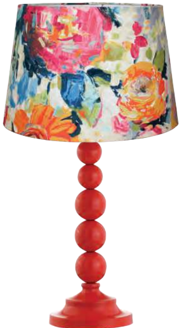
lamp + shade Almeria 20"-tall metal lamp, $59, safavieh.com for stores; Peony Floral 10"-tall cotton shade, $120, sassyshades.etsy.com