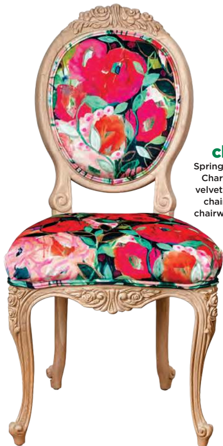
chair Spring Collection Charley Floral velvet and wood chair, $1,499, chairwhimsy.com