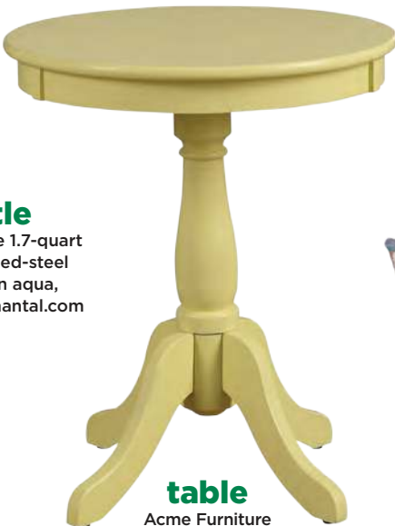
table Acme Furniture Alger 22"H x 18"-diameter wood table in light yellow, $79, walmart.com